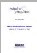
Balanço das negociações dos reajustes salariais do 1º semestre de 2015

"The average value of increase in real terms (0.51%) reflects an adverse situation", José Silvestre, coordinator of Trade Union Relationships of Dieese, states. According to him, this result occurs due an increase in inflation, along with an increase of unemployment