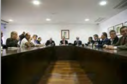
Read the Note of Trade Unions