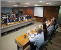
Nissan's practices are denounced at the Senate