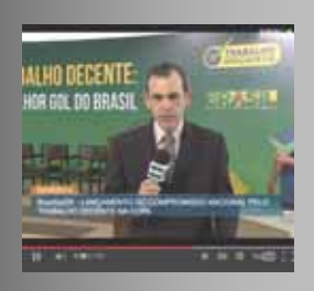
Watch the video on the release of the Commitment