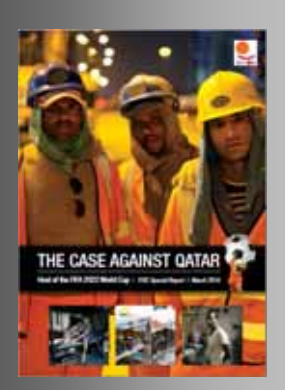
The case against Qatar