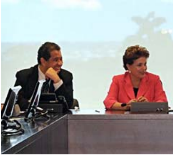
Leaderships from UGT had their first meeting with the president Dilma Rousseff

Leaderships from UGT and the main trade union centrals of Brazil had their first meeting with the president Dilma Rousseff.