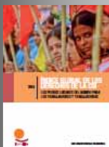
ITUC's Global Rights Index

The ITUC Global Rights Index found that while the right to strike is recognised in most countries, laws and practices in at least 87 countries exclude certain types of workers from the right to strike.