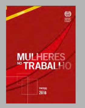
Women at Work Trends 2016

The report "Women at Work: Trends 2016" examined data of up to 178 countries and concluded that inequality among men and women persists in a wide spectrum of the global job market. Besides, the report shows that women achieved, over the last two decades, significant progress in education, which does not mean comparable improvements in their job positions.