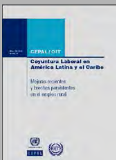
Coyuntura Laboral en América Latina y el Caribe

In 2015, the average unemployment rate reached 6.5% in the region due to a slight regional GDP (Gross Domestic Product) contraction.