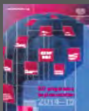
ILO programme implementation 2014-15 □□

On June 19, another meeting of this tripartite group ought to take place, which should be the last one preceding its participation in the Conference.