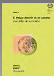
Decent work in global supply chains □