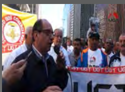
UGT TV - One Hundred Years of Samba

As part of the program of the photographic exhibition Workers and 100 years of Samba, organized by UGT, on Sundays, major names of samba are saluted at Paulista Avenue through concerts with artists that represent such a Brazilian rhythm. Concerts took place at the Paulista Avenue, in front of the Trianon park, next to the MASP museum.