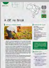
ILO in Brazil

The publication "ILO in Brazil" describes the main achievements of ILO and details the current activities of ILO to promote decent work in this country. It offers a brief history of the relationship between ILO and Brazil, a general view of the current situation of our country and the main remaining challenges in issues related to the labor world.