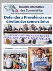
Newsletter of the Commerce Workers Union of Belo Horizonte

"When it comes to reform, as in terms of renovating a house, for example, you think of improvement, expansion, beautification. But in recent years, when governments announced "reforms" what fell directly on workers was the withdrawal of historic rights, worsening conditions of life and work, loss of purchasing power, tightening, increasing the deadline for retirement, etc.," says the newsletter, which also has important news for the commerce class.