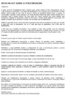
Nota da UGT sobre a Terceirização