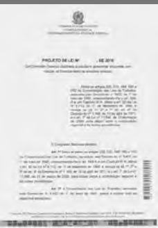
Union Activity under law project