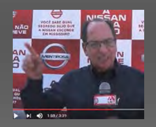
See the protest at Avenida Brazil