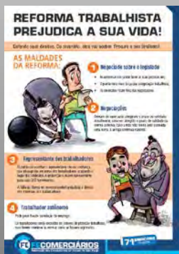
Labor Reform Harms Your Life!